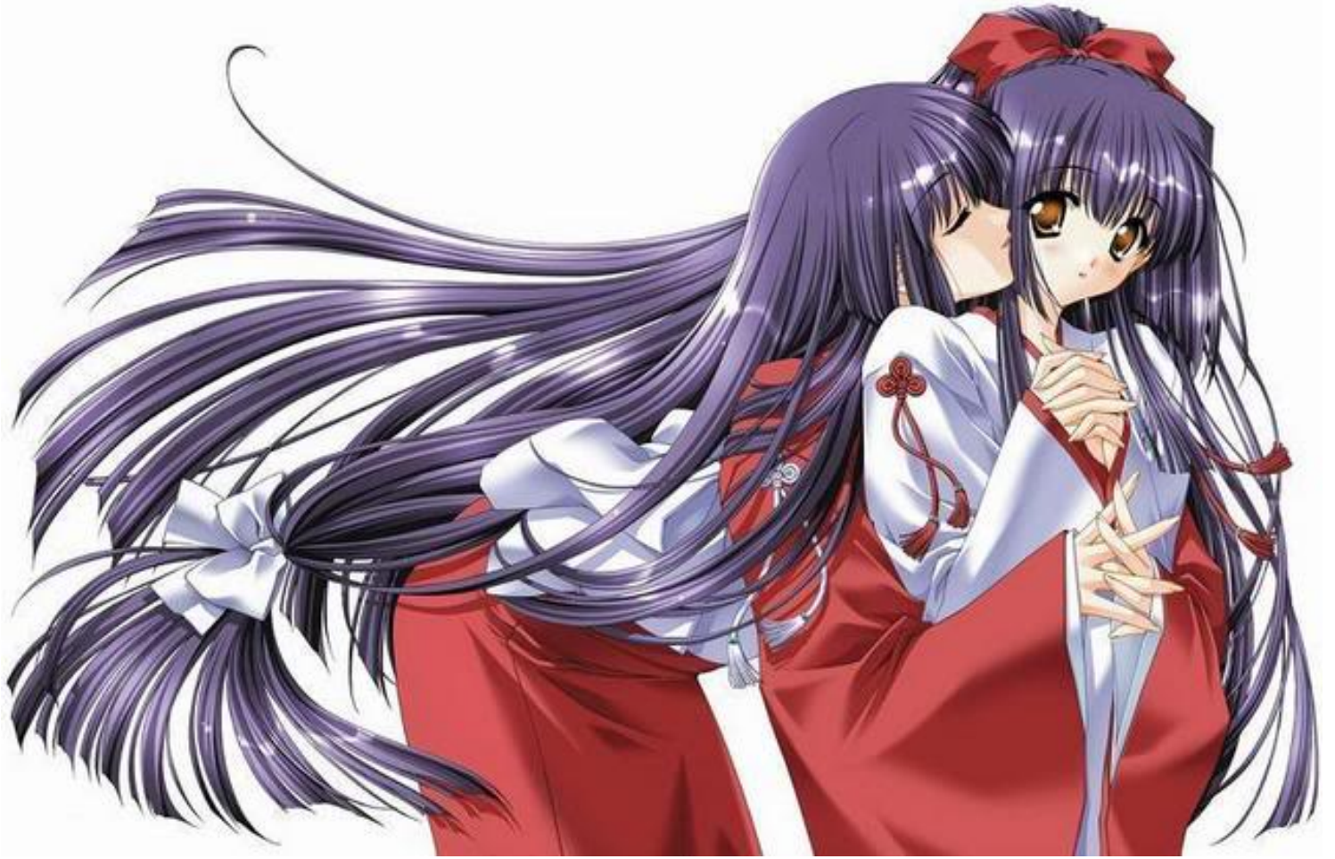
aimi and her mother... if she was still alive