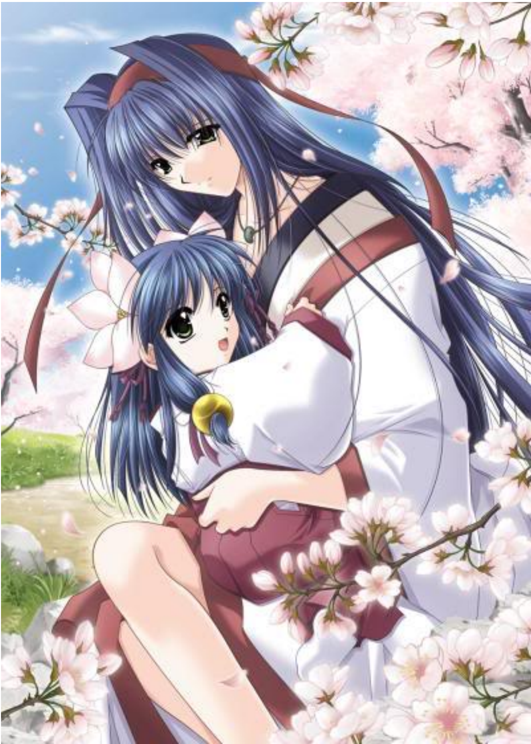
Aimi and her mother when aimi was 2 or 3